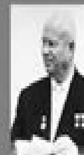
Nikita Khrushchev First Secretary