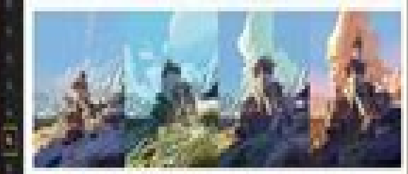
A bastion grows over time.

Bastions are the most important structures in the game. They are the main source of power and protection for the players. Bastions are built on a grid and can be upgraded to provide various benefits.