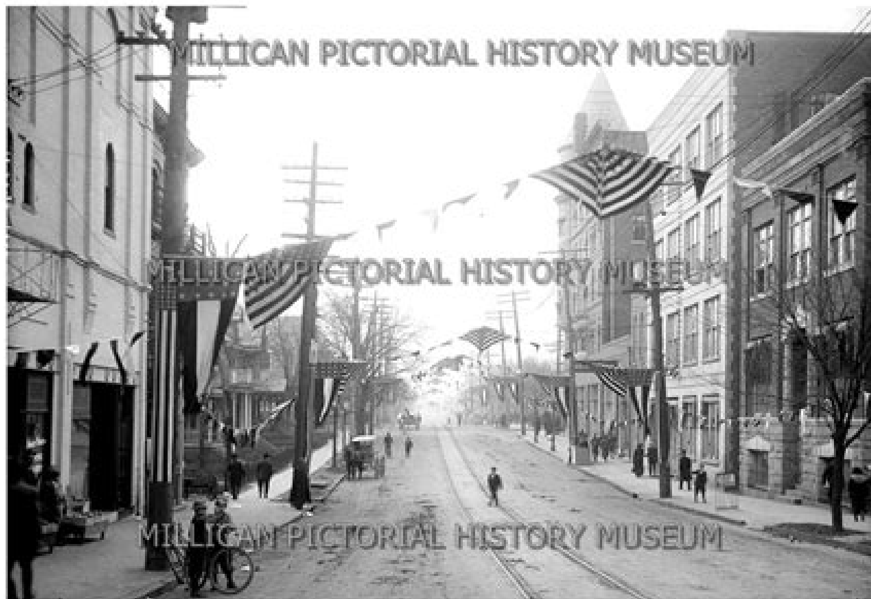
RALEIGH NEWS & OBSERVER ON RIGHT, RALEIGH HOTEL RIGHT CORNER WEST MARTIN STREET, RALEIGH, NORTH CAROLINA, EARLY 1900s