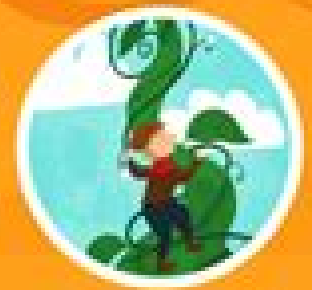
Jack and the Beanstalk