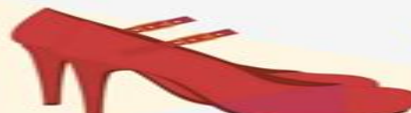
Mary Jane platforms