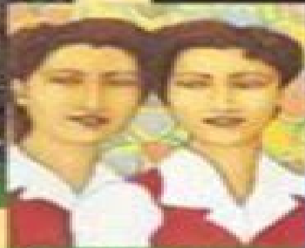
Amigas de una escuela