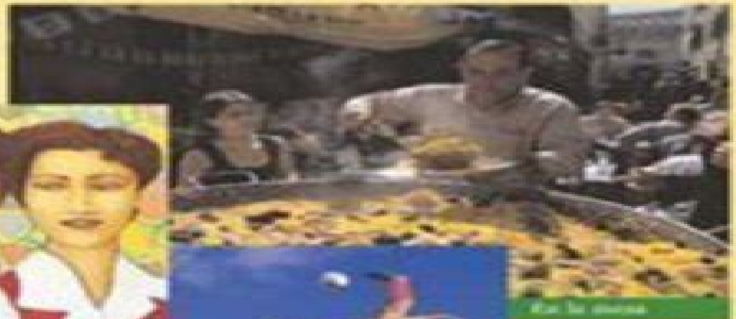
En la cocina