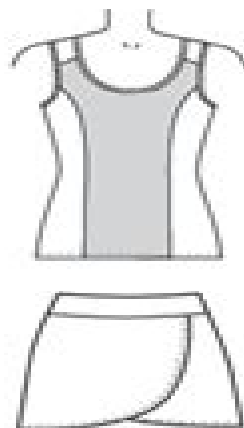
2. KWIKSEW K4113