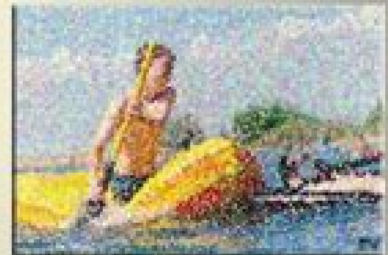
Example of a pointillistic painting