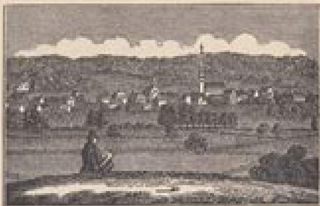
John Warner Barber sketching his View of Farmington from Round Hill about 1836

Reproduced from Barber's "Connecticut Historical Collection"