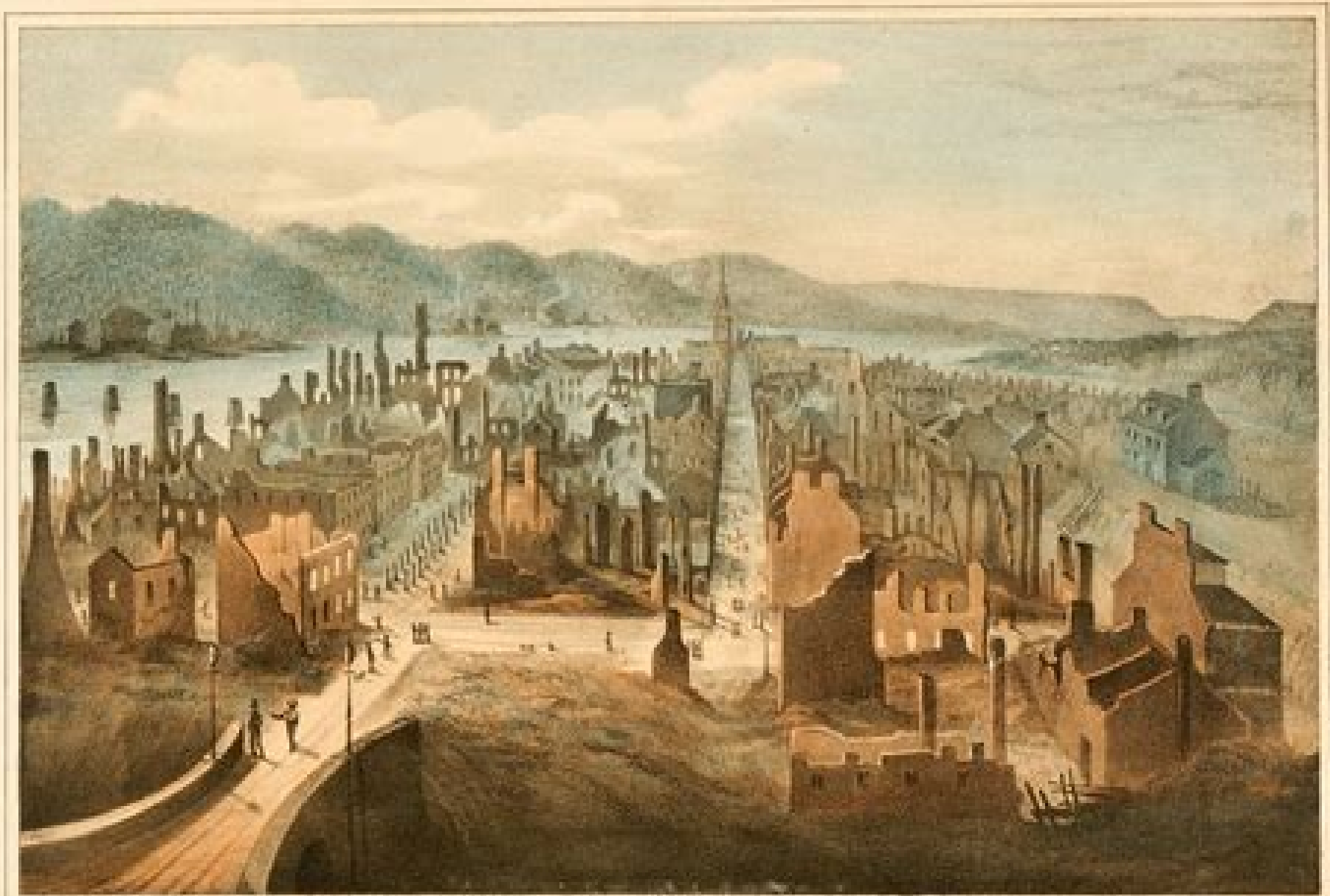
VIEW of the RUINS of the CITY of PITTSBURGH from BOYD'S HILL.