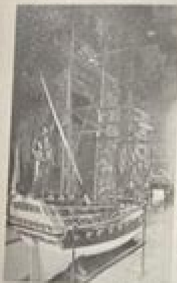
"Flaming on Stand" - 1736

the celebrated model of Trafalgar, showing the position of every ship in the great battle of 21 October 1805 was, just as the Flaming was sailing