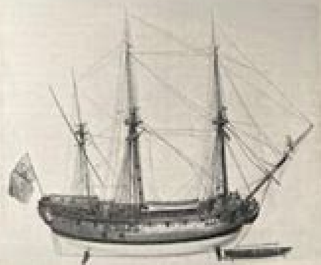
74 Gun Frigate of the period 1780