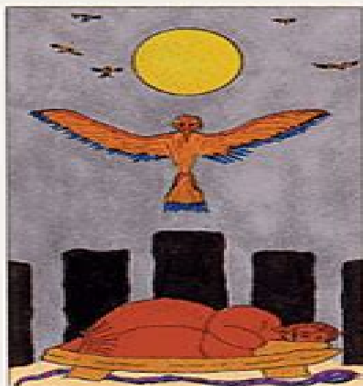
6 of BIRDS