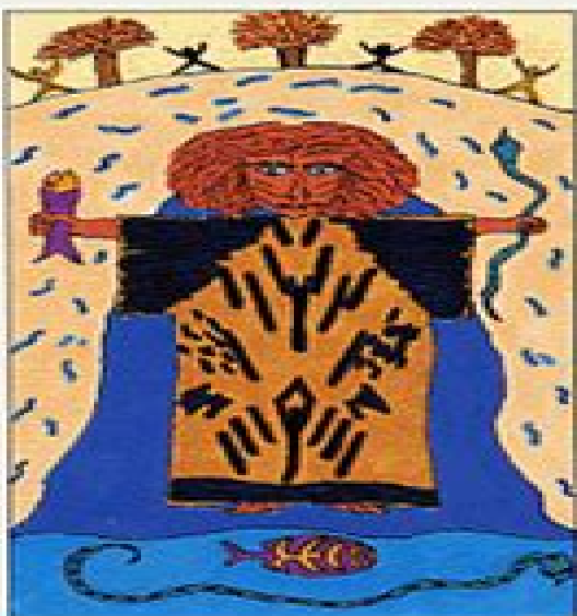
KNOWER of RIVERS