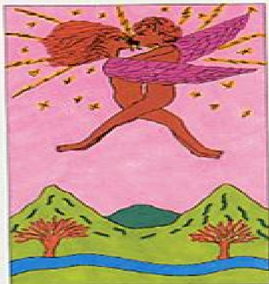
The LOVERS 6