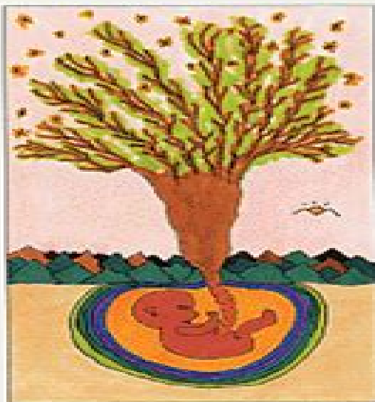
ACE of TREES