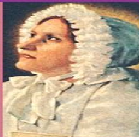
Bl. Anna Maria Taigi (1769-1837), wife, mother of seven, mystic and counselor of Popes and Saints.