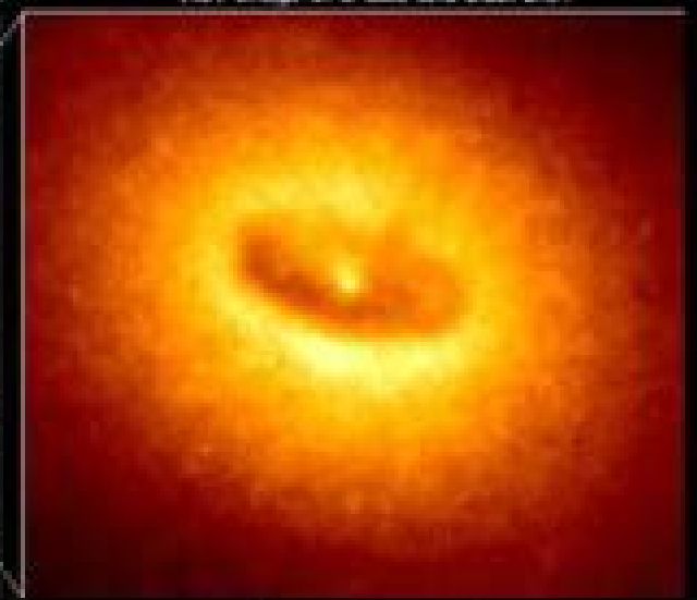
HST Image of a Gas and Dust Disk