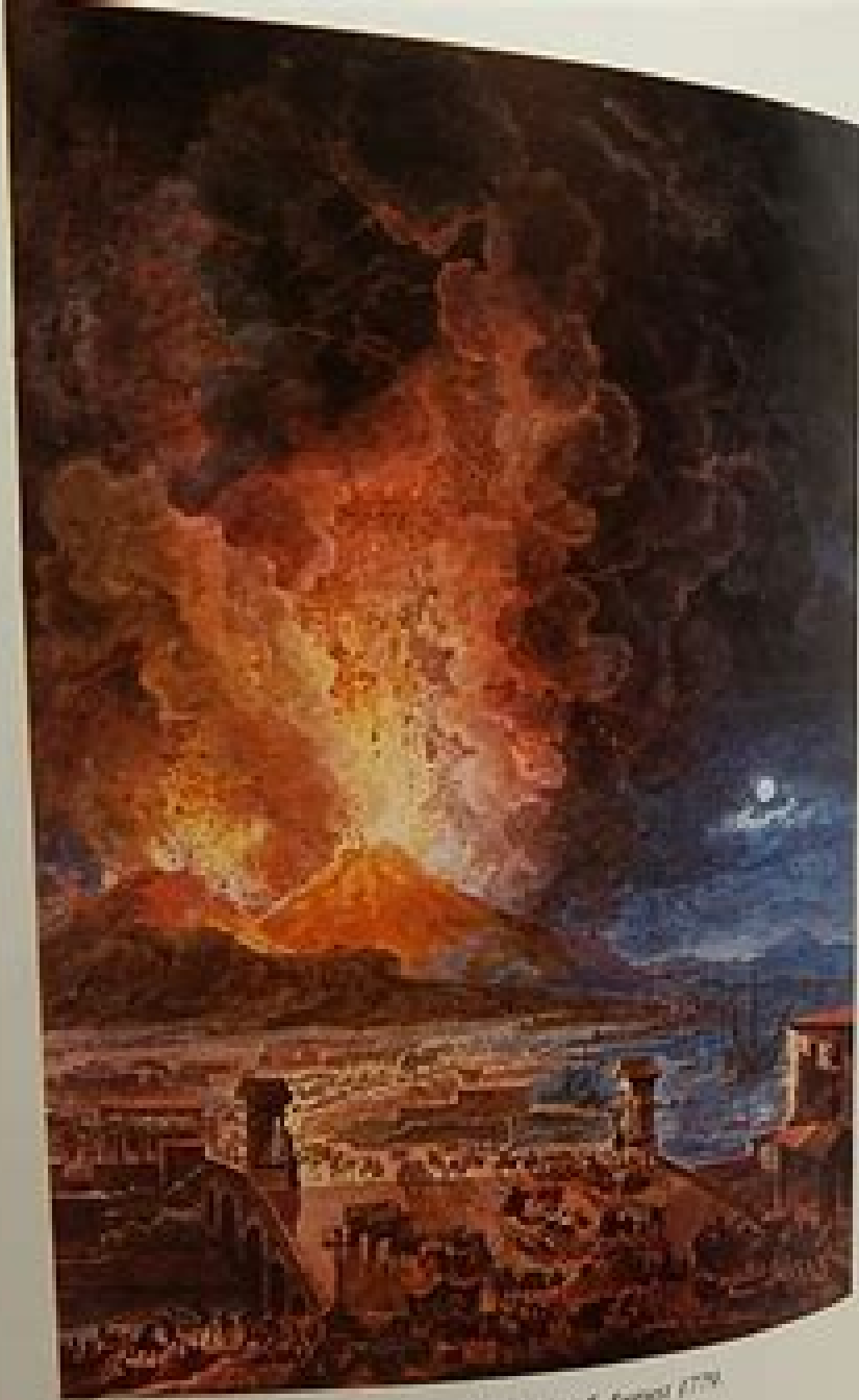
1. The eruption of Vesuvius, 8 August 1799.