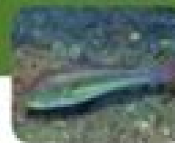
Emerald Parrotfish Nicholsinia uza