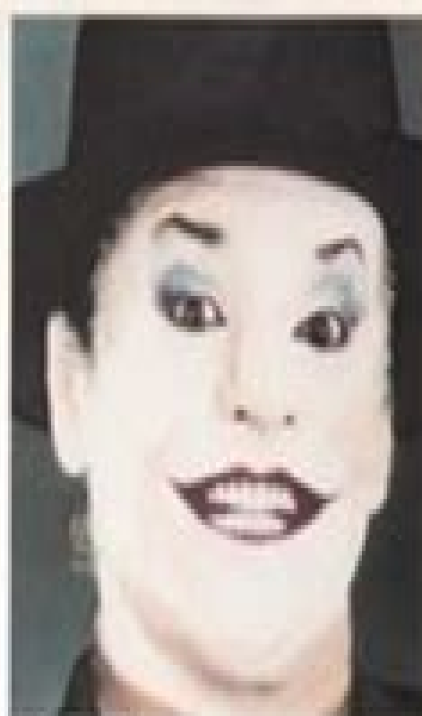
and the John?