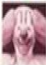
and Rose the Queen?