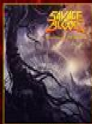
Warriors Of The Fortress digital single not new on all common platforms