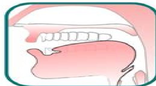
/ɒ/ - short 'o'