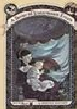
«THE WISE WINDOW»