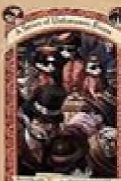
«THE FIDELITY FERIA»