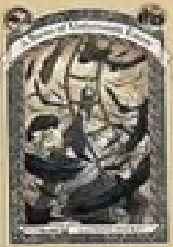
«THE WILD VILLAGE»