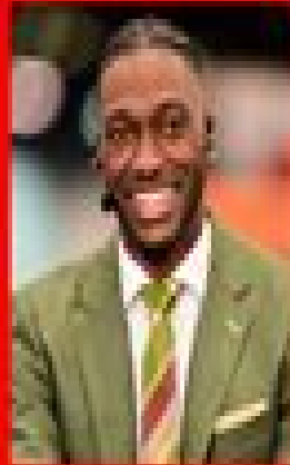
ROBERT GRIFFIN III ANALYST