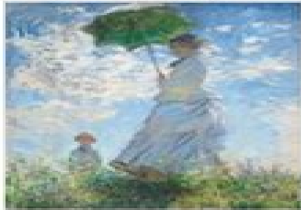
"Woman With a Parasol, 1875" The National Gallery of Art