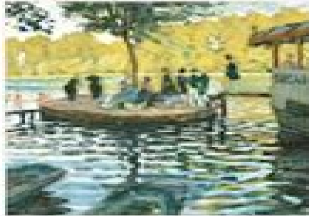
"La Grenouillère, 1869" The MET Museum