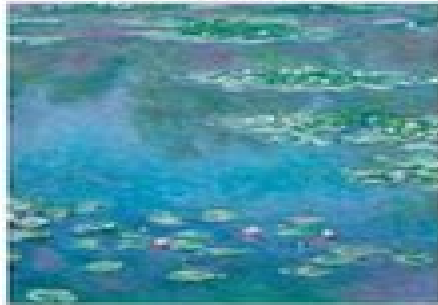
"Water Lilies, 1906" The Art Institute of Chicago