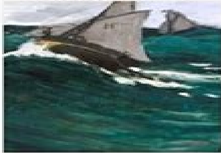
"The Great Wave, 1866 - 1867" The MET Museum