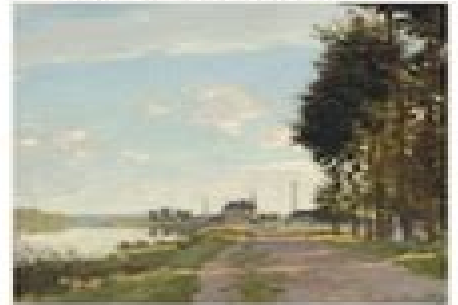
"Argenteuil, 1872" The National Gallery of Art