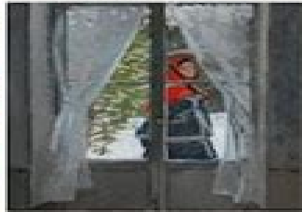
"The Red Kerchief, 1868 - 1873" The Cleveland Museum of Art