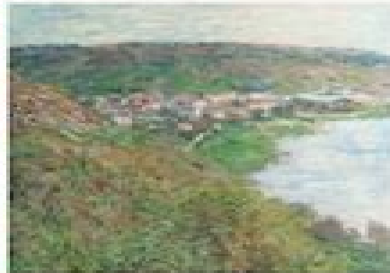
"View of Vetheuil, 1880" The Los Angeles County Museum of Art