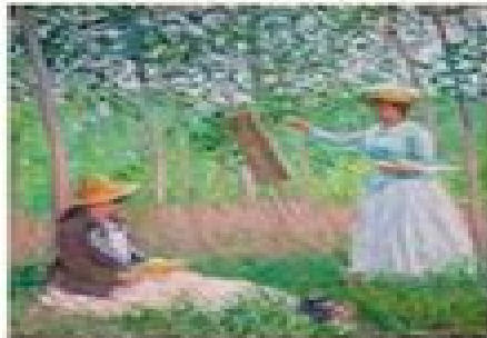
"In The Woods at Giverny, 1887" The Los Angeles County Museum of Art