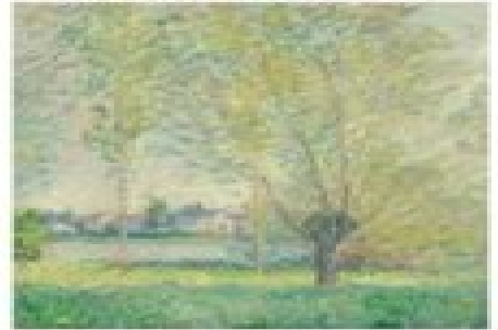
"The Willows, 1880" The National Gallery of Art