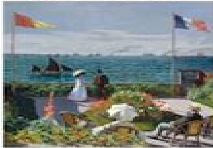
"Garden at Sainte, 1867" The MET Museum