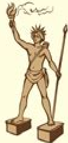
Colossus of Rhodes