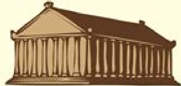
Temple of Artemis at Ephesus