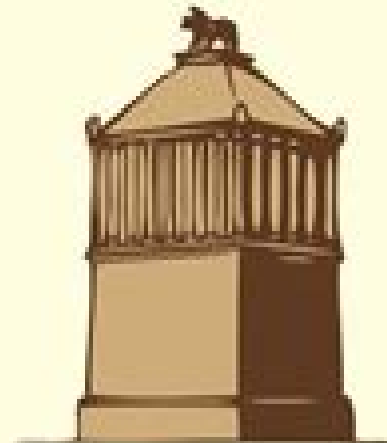
Mausoleum at Halicarnassus