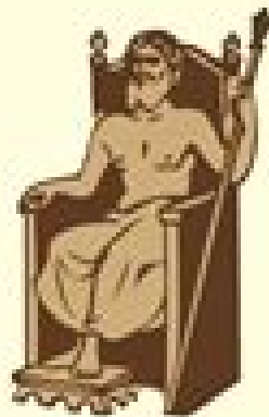
Statue of Zeus at Olympia