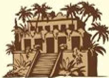
Hanging Gardens of Babylon