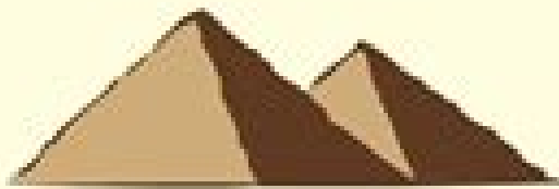
Great Pyramid of Giza