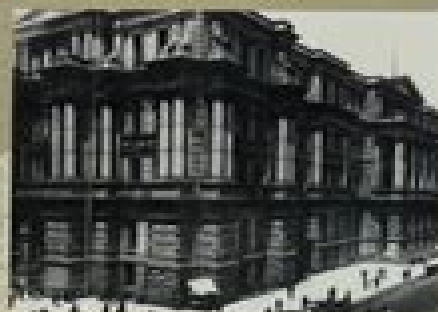
STOCK EXCHANGE BUILDING