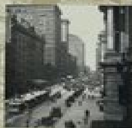
KANSOLAH STREET, CHICAGO'S MAJOR THEATER THEATRE DISTRICT CITY CENTER