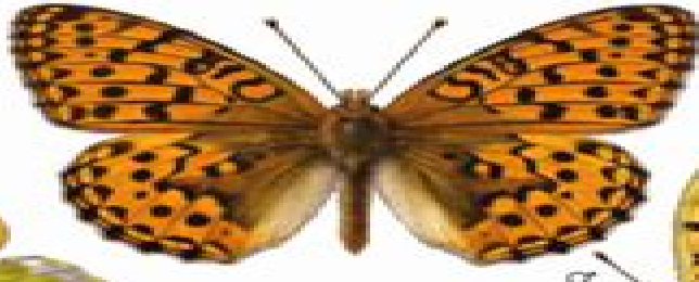
32. Dark Green Fritillary Argynnis aglaja