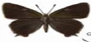
49. White-letter Hairstreak Satyrium w-album