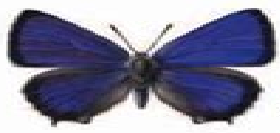
47. Purple Hairstreak Favonius quercus