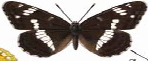
34. White Admiral Limenitis camilla