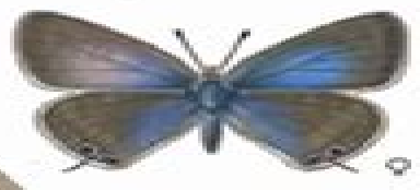
51. Long-tailed Blue Lampides boeticus