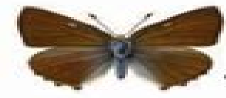
48. Green Hairstreak Collophrys rubi