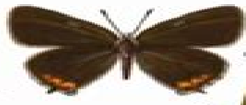
50. Black Hairstreak Satyrium pruni