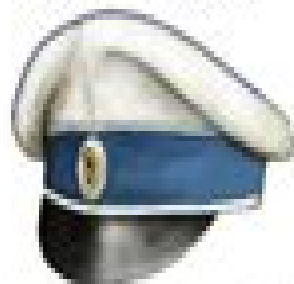
Guard Officer Furazhka