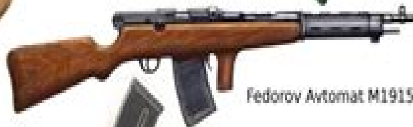
Fedorov Avtomat M1915