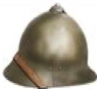
Sohlberg Helm M17