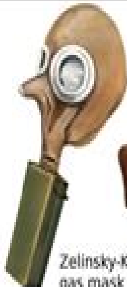
Zelinsky-Kumant gas mask