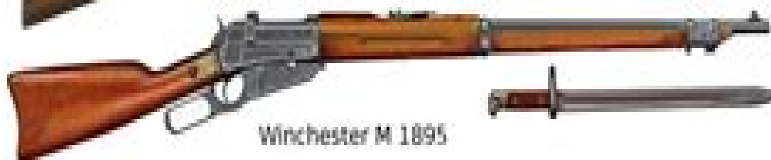
Winchester M 1895