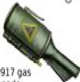
M1917 gas grenade