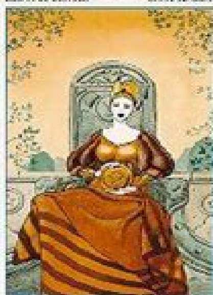
REGINA DI DENARI