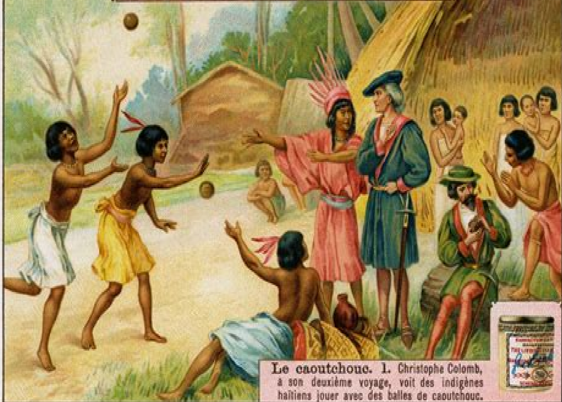
Le caoutchouc. 1. Christophe Colomb, à son deuxième voyage, voit des indigènes haïtiens jouer avec des balles de caoutchouc.