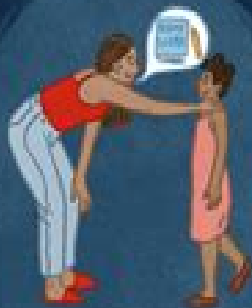
Give effective instructions