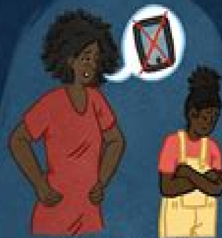
Use consistent consequences