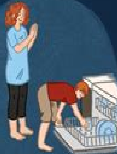
Praise your child's effort