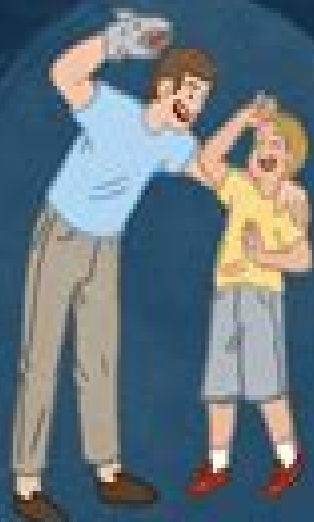
Provide positive attention