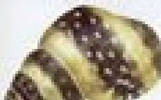
Checkered Periwinkle (W)

Littorina maritima To 1 in. (2 cm) high Grayish-white, sculpted shell has low spiral ridges. Common in marshes and estuaries.