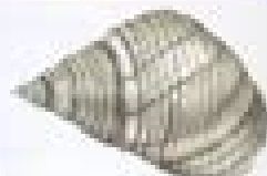
Marsh Periwinkle (CB,V)

Euryspira caudata To 1.5 in. (4 cm) high Small shell has a pointed apex and spiral ridges. Feeds primarily on oysters.