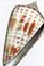
Alphabet Cone (CB)

Cerithium californicum To 1.8 in. (4.5 cm) Spiral high-spired shell is common on intertidal flats in estuaries and bays. Can climb trees and be out of water for extended periods.