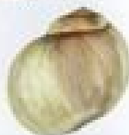
Common Northern Moon Snail (B,CB)

Campeloma circosulcata To 1 in. (2 cm) high White to grayish shell has prominent ridges and spiral bands with brown blotches. Feeds on biofilms.