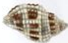
Circled Rocksnail (CAS)

Campeloma circosulcata To 1 in. (2 cm) high White to grayish shell has prominent ridges and spiral bands with brown blotches. Feeds on biofilms.