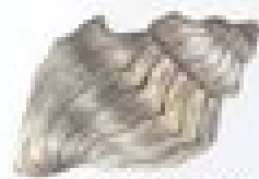
Frilled Dogwhelk (W)

Collusio sp. To 1 in. (2 cm) high Pearl-like, strongly ridged shell is as wide as it is high.