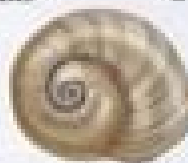
Shark Eye (E)

Tegula funiculata To 1 in. (2 cm) Rounded, black shell with a smooth apex.