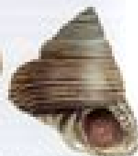
Ribbed Top Shell (W)

Hydrobia ulitiformis To 1 in. (2 cm) high Cone-shaped shell is blackish to brownish-gray. Feeds on biofilms.