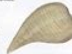
Common Fig Shell (CB)

Hydrobia ulitiformis To .75 in. (2 cm) Very fragile white to yellowish shell has a delicate lip. Shells are so light they are often transported to the highest tide line.