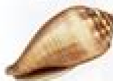
California Cone (CAS)

Alia carinata To 3 in. (7.5 cm) high Small shell has a pointed apex. Inside is pinkish white. Common in shallow water.