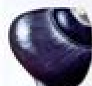
Black Top Shell (W)

Polinices bipartitus To 1 in. (2.5 cm) high Rounded shell is grayish to brownish, (dark to red) to bore holes into biofilms.