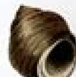
Common Periwinkle (B,V)

Euryspira angulata To 1 in. (2 cm) high Shell has 8-10 deep, blade-like ribs.