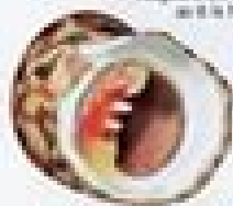
Bleeding Tooth (CB)

Hydrobia ulitiformis To 1 in. (2 cm) Brown to white shell has body seal frills and spines. Species found in aquatic waters have smoother shells. Found in intertidal waters.