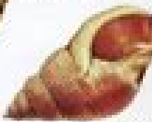
Channeled Nassa (CA)

Scaphella junonia johnstoni To 3 in. (7.5 cm) Deep water Gulf Coast shell only reaches up on shore after severe storms. Alabama's state shell.