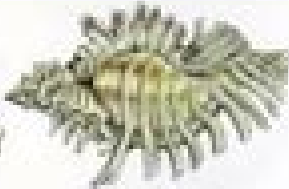
Lace Murex (CB)

Cerithium foliatum To 1.5 in. (4 cm) high Shell has three large, leaf-like flanges. Color varies from white to dark brown depending on location.