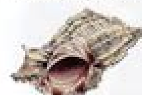
Apple Murex (CB)

Murex glaucus To 2 in. (5 cm) Elaborate pinkish-white to brownish shell with long flaps.