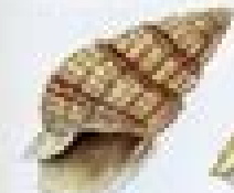
Three-lined Nassa (E)

Macroschisma carolinense To 2 in. (5 cm) Large, brown shiny and shell is white-spotted. Note prominent teeth lining central opening.