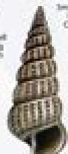
California Horn Snail (CAS)

Conus californicus To 1.5 in. (4 cm) high Smooth brownish shell has a low spine. A carnivorous species that preys on prey with a harpoon-like tooth that injects poison. Do not handle live specimens.