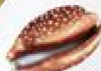
Atlantic Deer Cowrie (CB,CB)

Olivella septentrionalis To 2.5 in. (6 cm) Olive, yellow to grayish cylindrical shell has markings that resemble lettering. South Carolina's state shell.