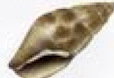
Carinate Downsail (W)

Chlorostoma porcellum To 4.5 in. (11 cm) Yellow-white to brownish shell has raised ribs but lacks long spines. Note brown spots on outer lip of shell.