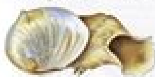
Solitary Glassy Bubble (V)

Conus septentrionalis To 3 in. (8 cm) Creamy shell has bands of red-brown splashes. Mouth is a long, dagger out of the narrow end of the shell.