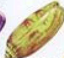
Lettered Olive (CB, CB)

Olivella biplicata To 1.5 in. (4 cm) high Smooth shell has a central spine. Color varies from purple to white and brown. Carnivorous scavenger feeds on animal remains. Shells were used by Native Americans in jewelry.