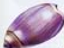
Purple Dwarf Olive (W)

Littorina littorea To 1 in. (2 cm) Gray to brown rounded shell has a low spine and low spiral ridges. Feeds in intertidal waters.