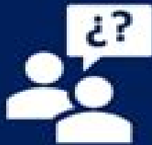
Limited English Proficiency