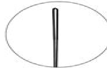
Single String Loop