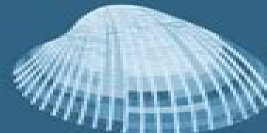
Heart Cockle Clam