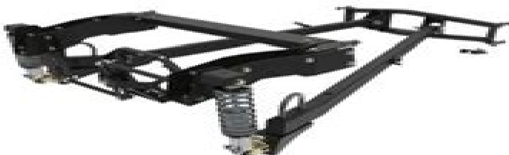
Trailing Arm Suspension