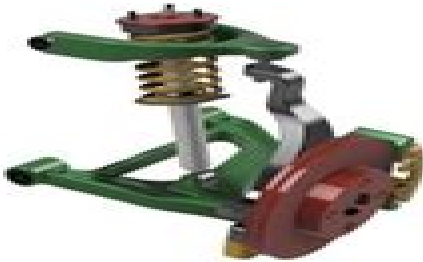
Double Wishbone Suspension