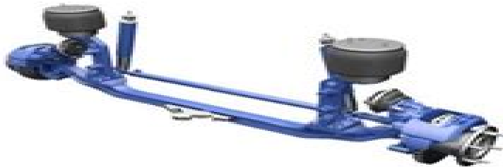
Rigid Axle Suspension