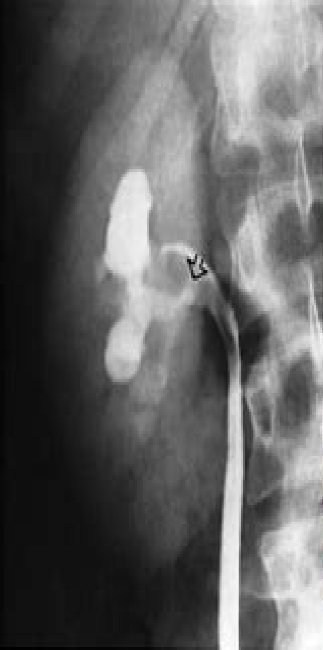
Fig. 6.38 Filling defect due to blood clot in the pelvis and upper ureter (arrow).