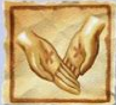
Anointing of the Sick