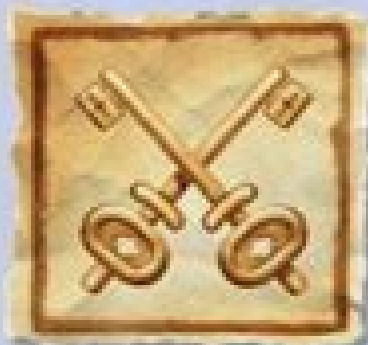
Penance and Reconciliation