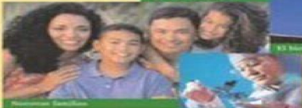
Un momento feliz