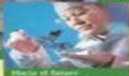
Momento de la vida