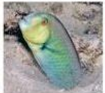
Parrotfish escape by diving into the sand