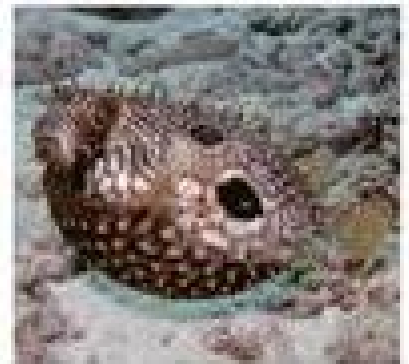
A flatfish inflates its body