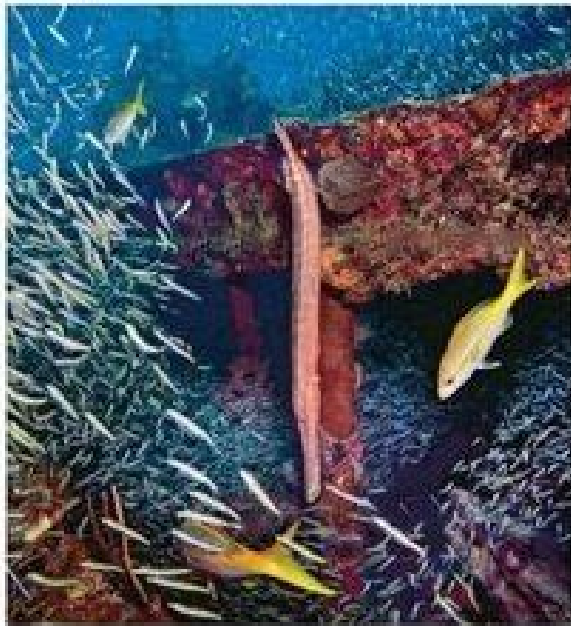
A huge school of silversides attracts piscivores from far and wide