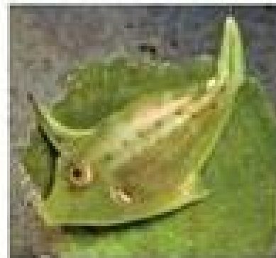
A distinctive bordercaul spine