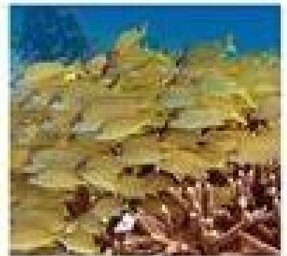
Parrot Grunts schooling for safety