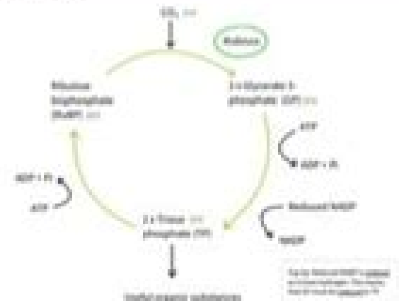
Diagram of the Calvin cycle