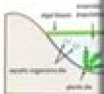
Diagram of eutrophication

Diagram to show how eutrophication happens