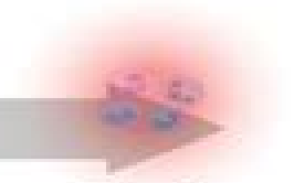
Chronic inflammatory state