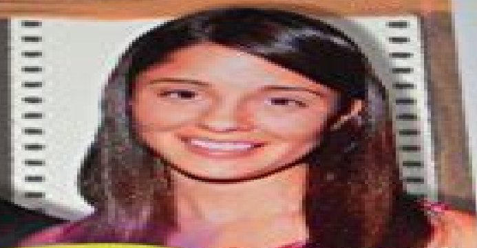
Shiri Appleby is Liz