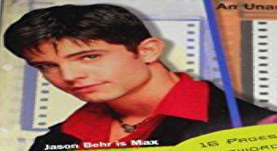
Jason Behr is Max