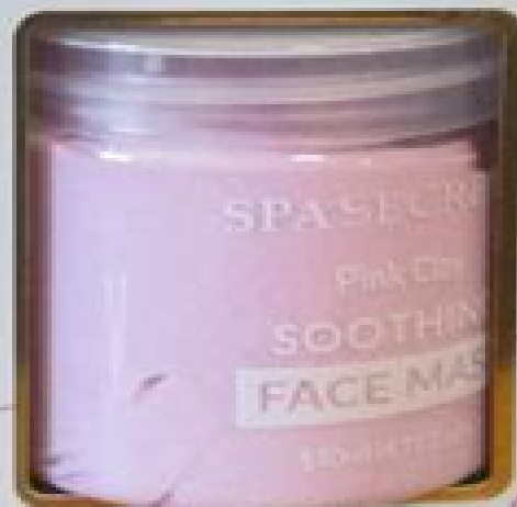
Pink Clay Mask

Specially prepared eye gel to soothe and cool