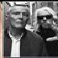
Tuesday, 16 June 2008