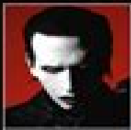
© 2004 Pearson Education, Inc. All rights reserved. www.pearsoned.com

Die Linderung | Nodfield | Reversed Chakra | Tayne