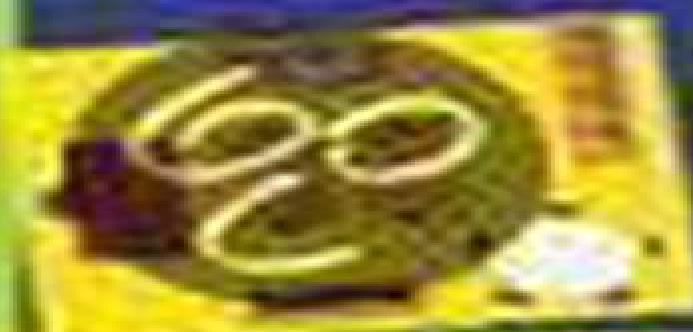
2. Reproducible Map & Globe Pages