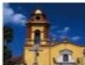
Church of San Francisco de Asís in Mexico The Church of San Francisco de Asís in Mexico