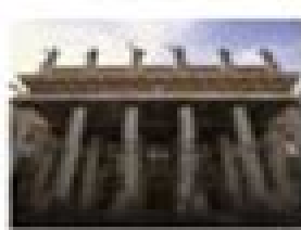
Church of San Francisco de Asís in Mexico The Church of San Francisco de Asís in Mexico