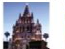
Church of San Francisco de Asís in Mexico The Church of San Francisco de Asís in Mexico