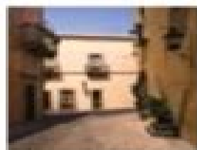
Church of San Francisco de Asís in Mexico The Church of San Francisco de Asís in Mexico