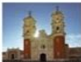
Church of San Francisco de Asís in Mexico The Church of San Francisco de Asís in Mexico

ENCUENTRA POR AQUÍ A LOS AGOSTALES CON UN CINE HORNO SANTIAGO CALVO - DICIEMBRE 1999