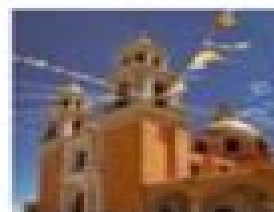
Church of San Francisco de Asís in Mexico The Church of San Francisco de Asís in Mexico