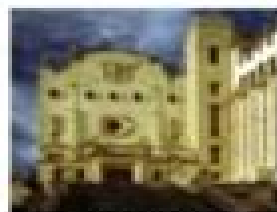
Church of San Francisco de Asís in Mexico The Church of San Francisco de Asís in Mexico