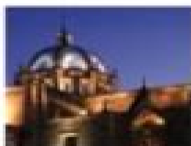
Church of San Francisco de Asís in Mexico The Church of San Francisco de Asís in Mexico