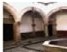
Church of San Francisco de Asís in Mexico The Church of San Francisco de Asís in Mexico