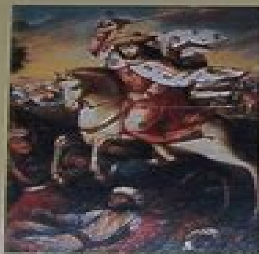
Chivalry, 1989, M. C. Escher - 1989