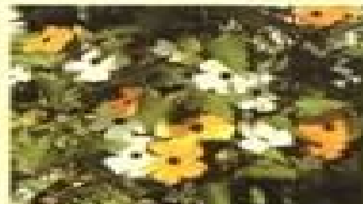
Flowering plant - 'Gypsy Pink' geranium