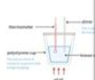
Diagram of calorimetry setup