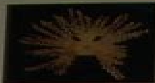
Sunburst, 1989, D. C. A. S. - 1989