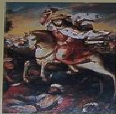
Warrior on Horseback, 1989, D. C. A. S. - 1989