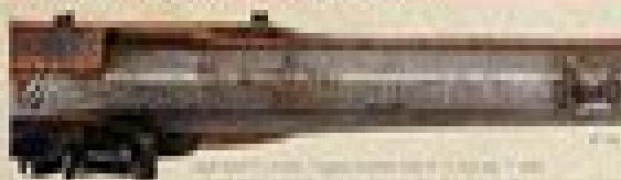
No. 45-A Hefflin Smooth Rifle